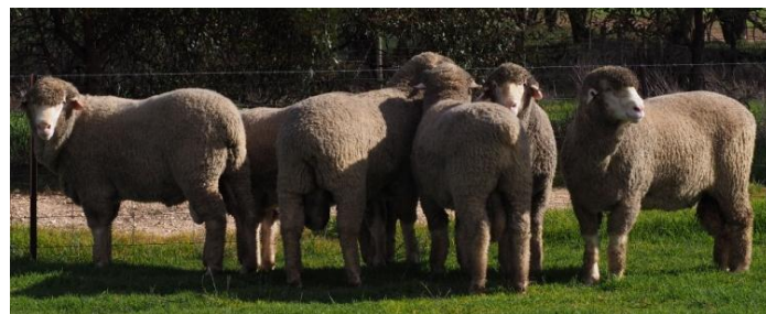
Above and below are some of the 2017 on property sale rams.

As was the case last year, there will be a main auction team of 120 shed prepared rams with a starting price of $800. A further 40 of the best paddock prepared rams will be offered in a second auction with a starting price of $600. There are some terrific genetics available in those paddock rams that simply lack the "gloss" of the shed preparation. We respectfully request that buyers take their rams on the day wherever possible.